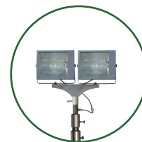
Type B: Metal Halide Lamp