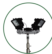
Type A: Halogen Lamp